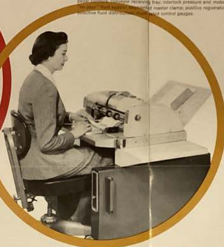
NEW DITTO 1020 SYSTEMS DUPLICATOR. Unsurpassed for order-billing, production control and other high volume systems work. Handles forms from 3" x 5" to 18" x 14". Includes adjustable stand, adjustable foot pedal controls, conveyor receiving tray, interlock pressure and motor controls, no mess fluid supply, mounted master clamp, positive registration, selective fluid distribution, precision control gauges.