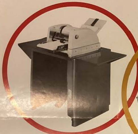
NEW DITTO 1020 SYSTEMS DUPLICATOR. Ideal for general production control and other high volume systems work. Handles forms from 3" x 5" to 18" x 14". Includes adjustable foot pedal controls, conveyor receiving tray, interlock pressure and motor controls, no mess fluid supply, mounted master clamp, positive registration, selective fluid distribution, precision control gauges.